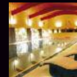
Health Club & Spa