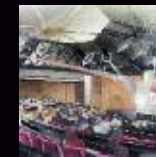
Crowne Plaza Oxford